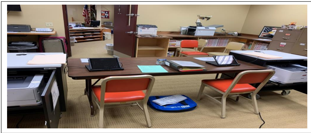
Example of an Inspector Table set-up back