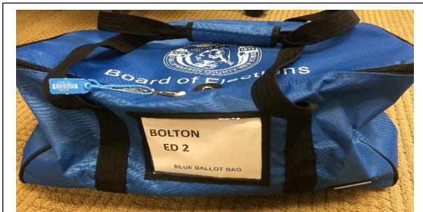
Blue Ballot Bag