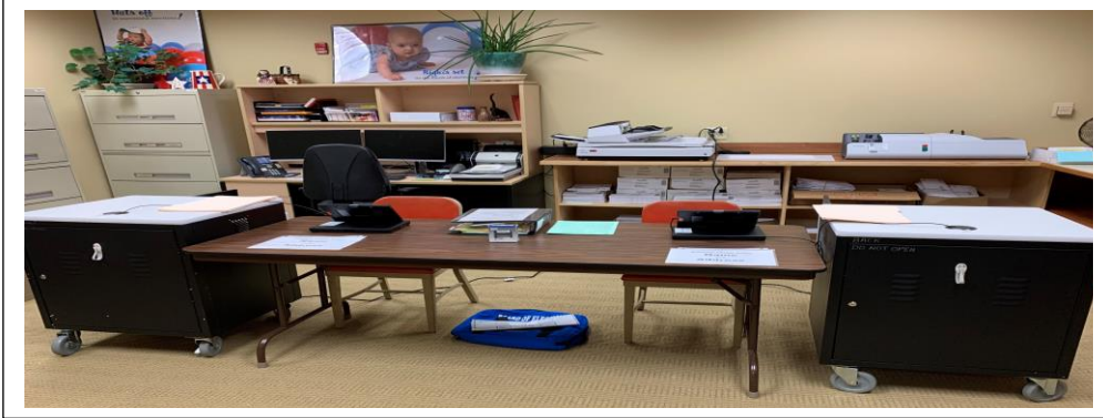
Example of an Inspector Table set-up front