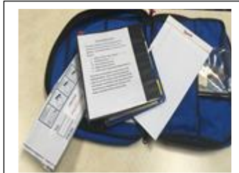
Blue Inspector Bag