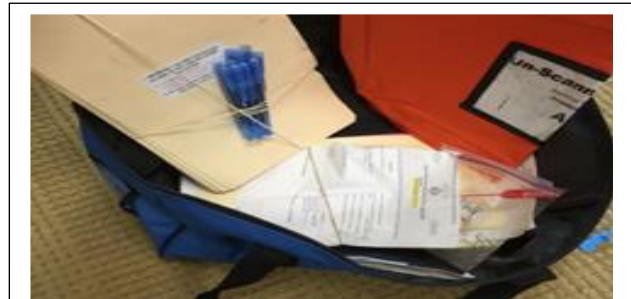
Contents of Blue Ballot Bag